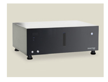
*The Ontrack Eraser Degausser is only available to customers outside of the US.